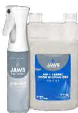
JAWS Ultra Mist – Spring Rain (6602) Bio-based air & fabric neutralizer