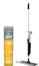
JAWS Citrus Balance Floor Cleaner (3702) Neutral floor cleaner cartridge for use with the JAWS mop