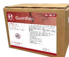
Husky Guardian Floor Finish (1002) Durable floor finish